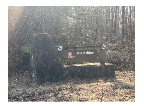
All information is subject to change. Map of the park and facility locations is on Page 2. Policies and rules are available on Page 3.

2367 Nix Bridge Park Road Dawsonville, GA 30534 Phone: (706) 344-3646 Email: recreation@dawsoncountyga.gov Website: www.dawsoncounty.org/parksrec