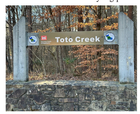
All information is subject to change. Map of the park and facility locations is on Page 3. Policies and rules are available on Pages 4-5.

154 Toto Creek Park Road Dawsonville, GA 30534 Phone: (706) 344-3646 Email: recreation@dawsoncountyga.gov Website: www.dawsoncounty.org/parksrec