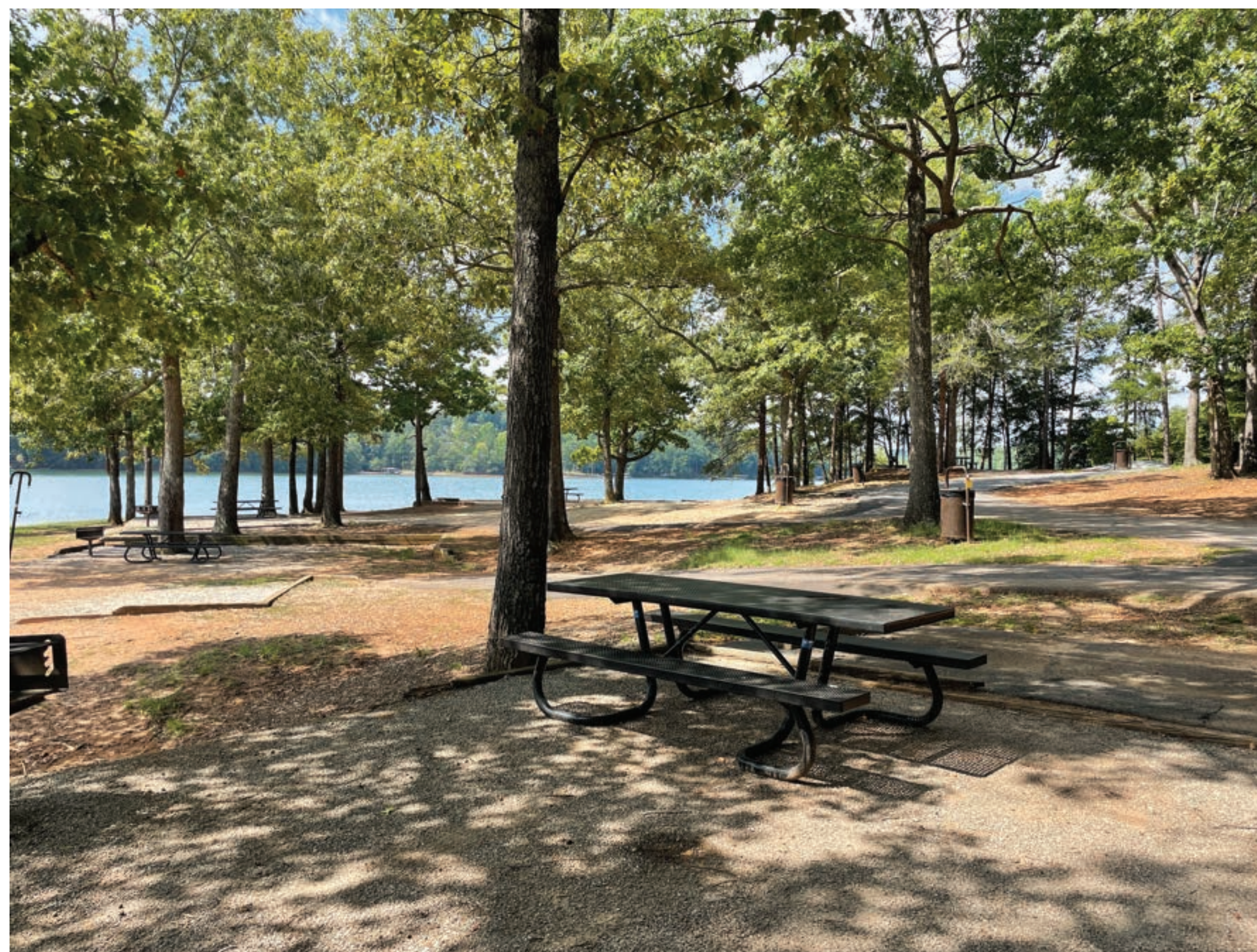
CAMPSITE LIVING AREAS IN NEED OF REFURBISHMENT