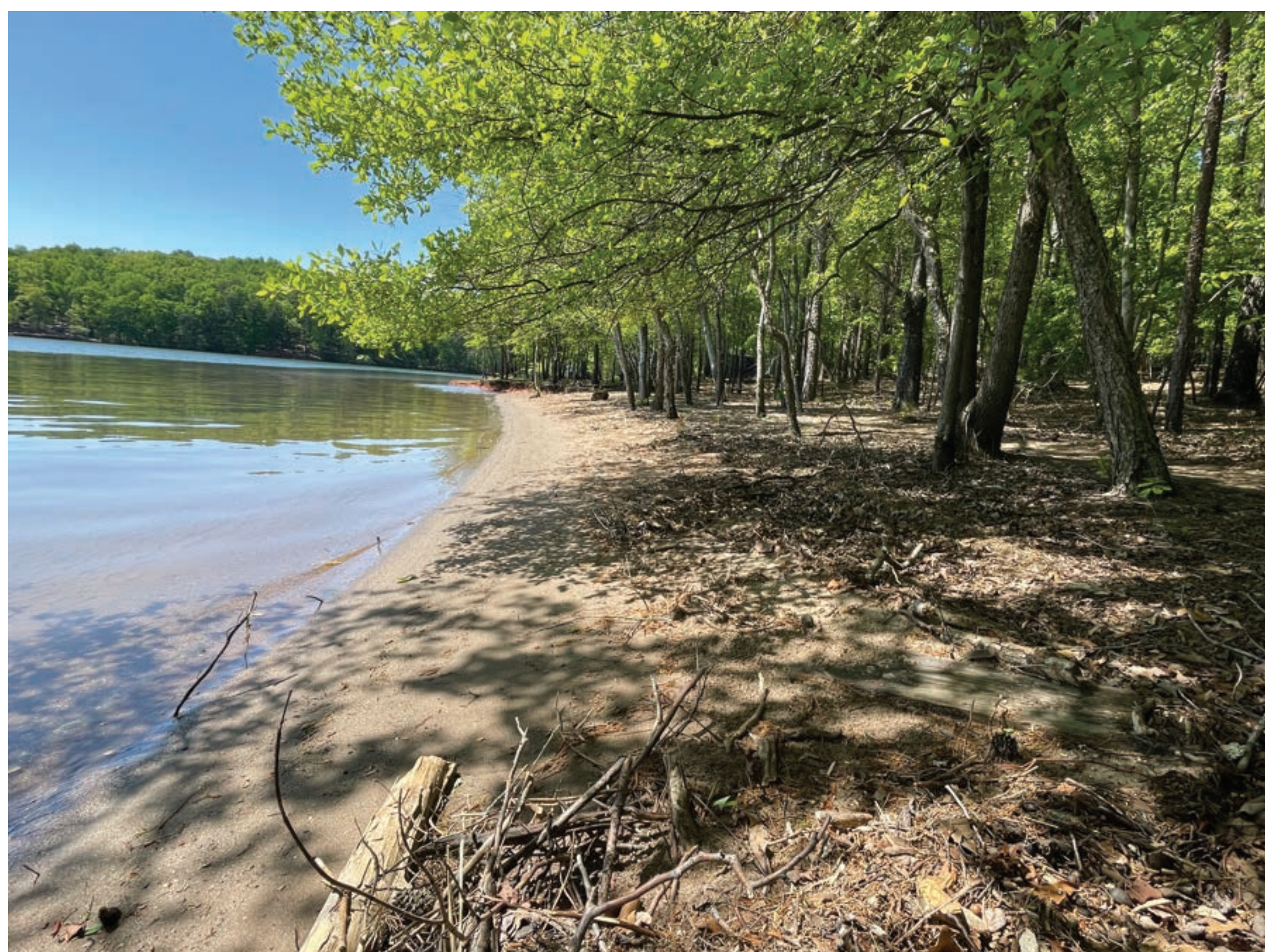
EXISTING SHORELINE NEAR BOATRAMP