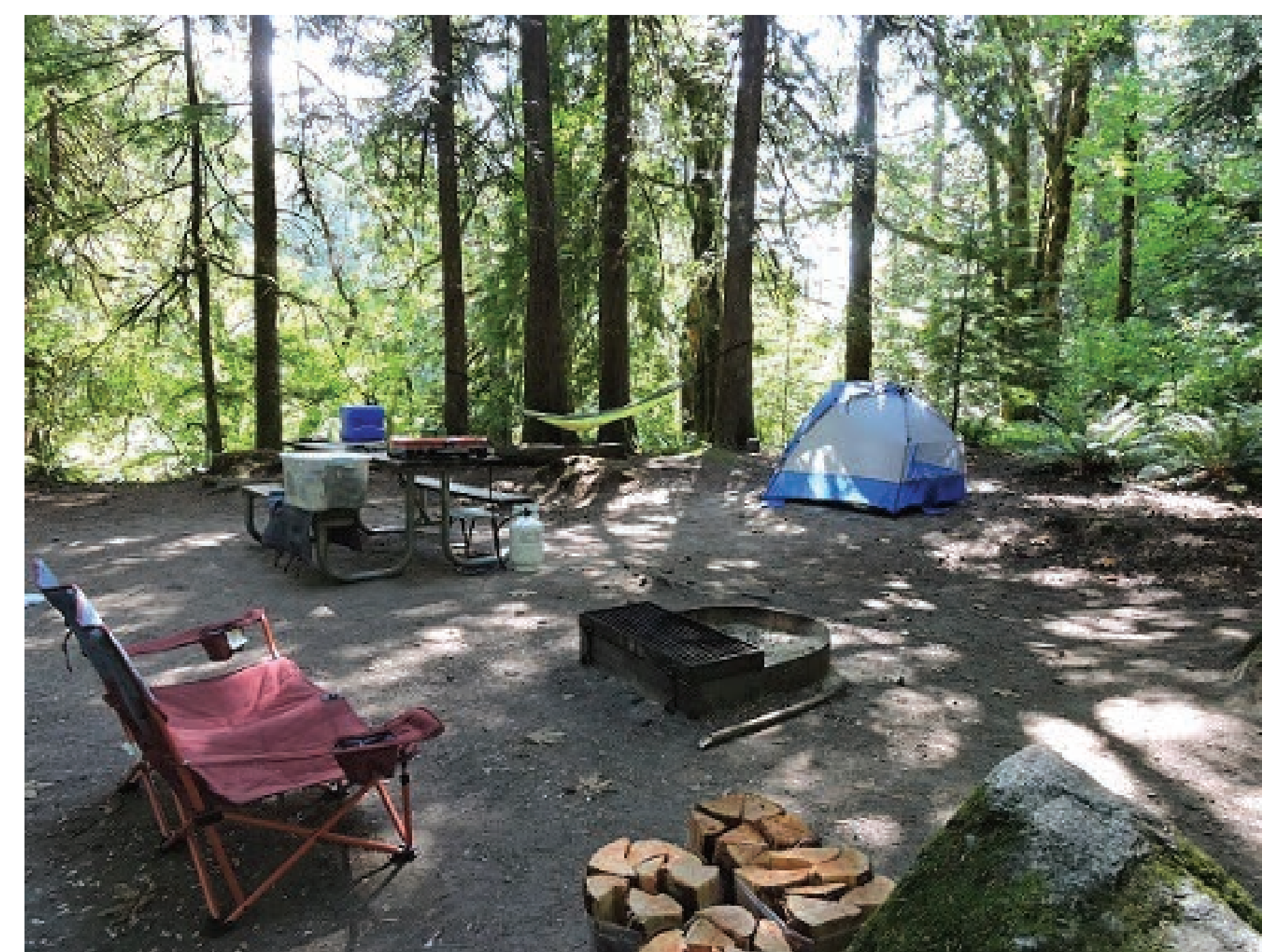
PIONEER WALK-IN CAMPSITES