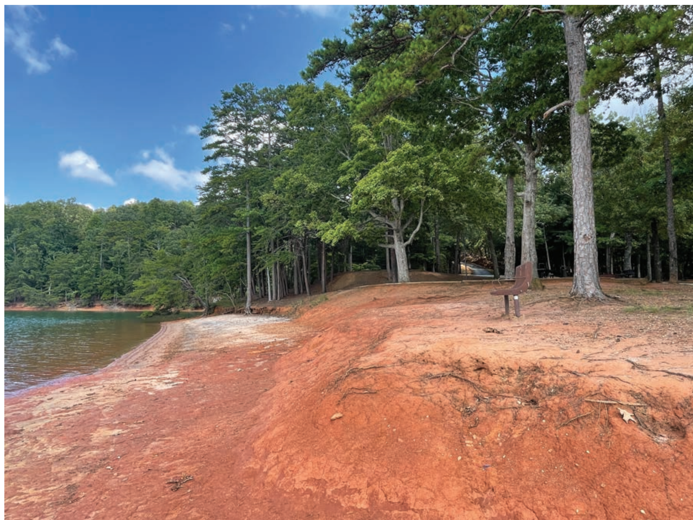
ERODED SHORELINE AND COMPACTED SOIL IN CAMPGROUND