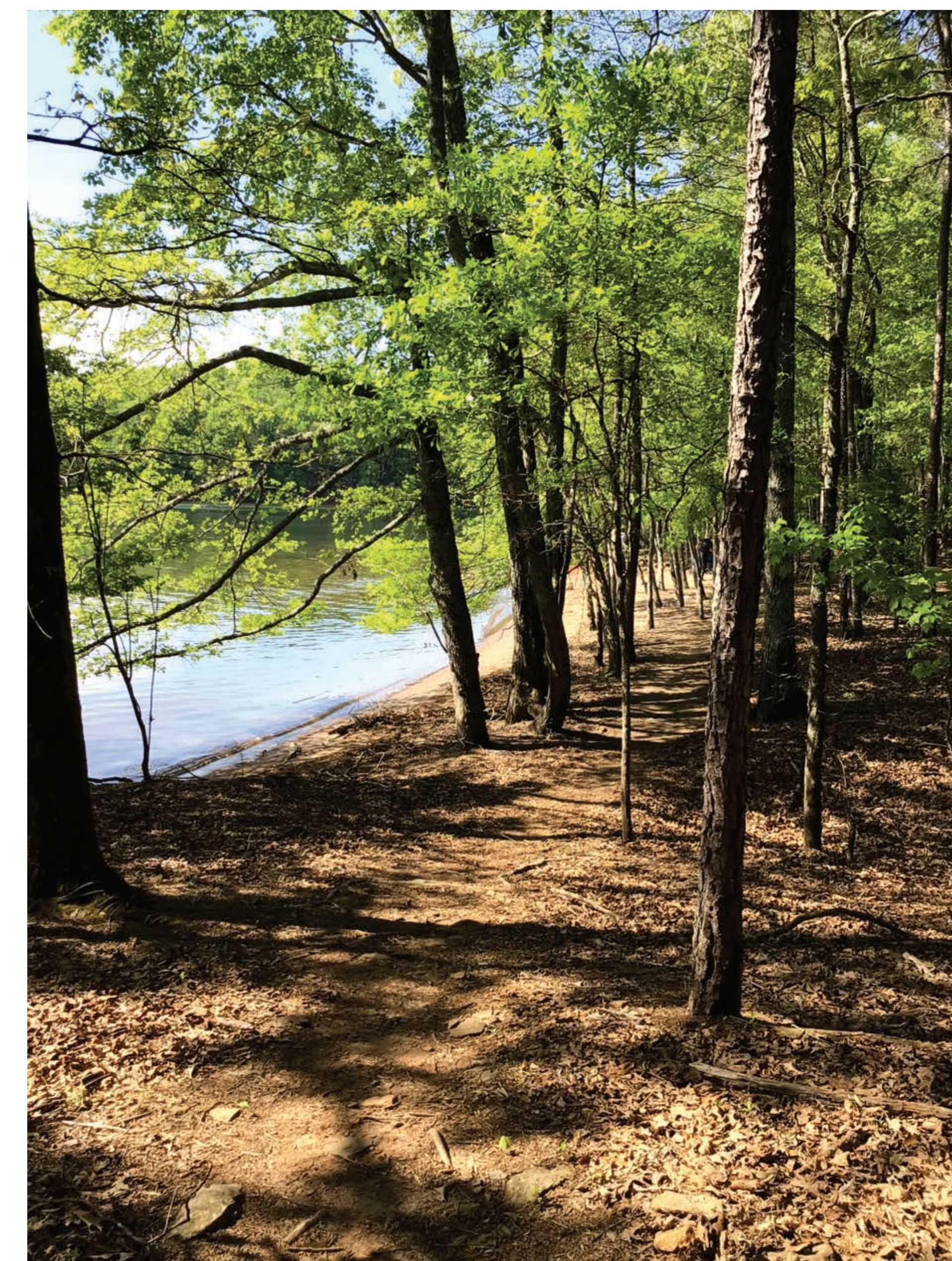
EXISTING HIKING TRAILS