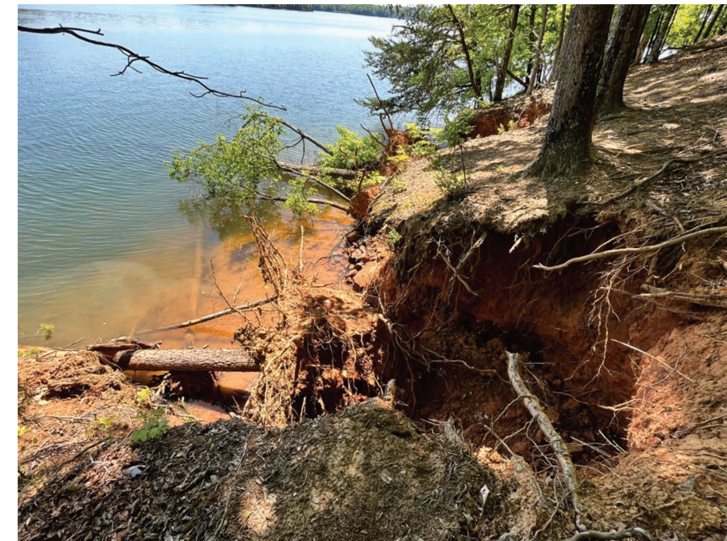
BANK FAILURE ALONG NORTH SHORELINE